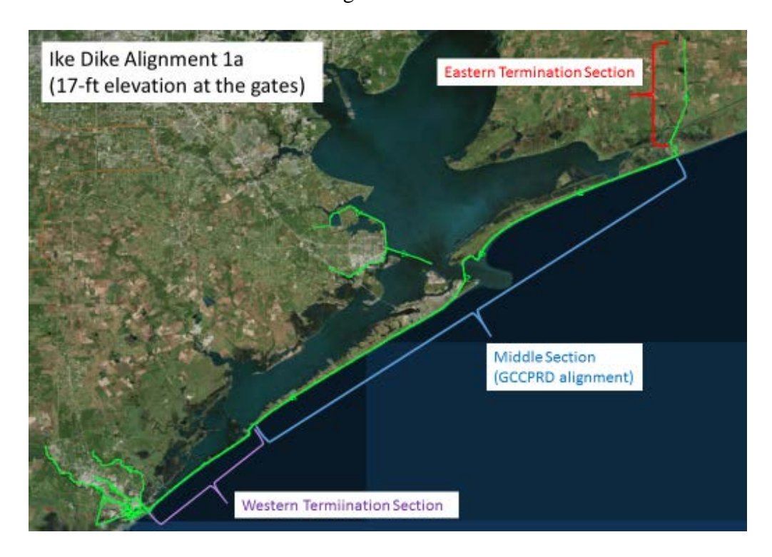
Figure 2. Alternate segments and alignments of the conceptual Ike Dike that were examined.

for a long coastal spine. Each alignment involved tying the 17-ft dike into higher ground elevations at different locations on both its eastern and western ends (Van Berchem et al., 2016). Based upon their work, an Alignment 1a was developed, see Figure 2, which included the following: a middle dike section that extends from San Luis Pass to High Island; an eastern termination section that turns inland at High Island and then follows Texas State Highway 124 north to Winnie, TX; and, a coastal western termination section that ends at Freeport. This alignment represents a slightly different version of the extended Ike Dike that is shown in Figure 1.