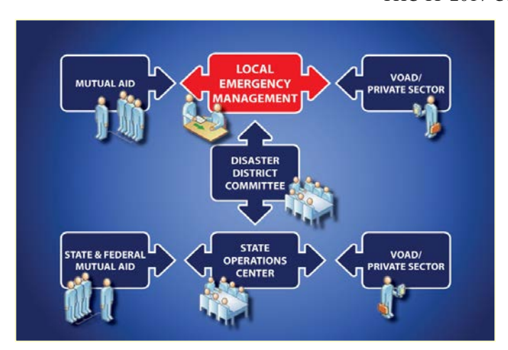
Figure 1 – Requesting Assistance