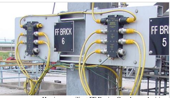
Hurricane resilient FF Device Couplers and wirings

systems with water-tight fasteners are required to construct hurricane resilient instrument networks. Some of the early FF installations gave real-world proof to this concept. FF installation at an Effluent Treater in a Shell Deer Park facility was located in a low area immediately beside the ship channel; it was constructed using TURCK device couplers and cables. Not long after the installation was complete the whole area was flooded and all of the Fieldbus segments operated while under water.