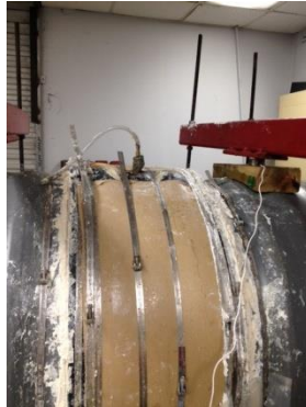
Figure 2. bladder