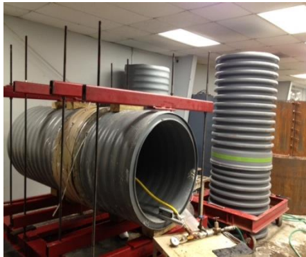
Figure 1. Repair of joint

3.4) Grout Injection: At this step it is all about the grout. The selected polyurethane grout is highly expansive and expands 5 to 15 times of its initial volume. As shown in Fig.4 the grout sets within 5 minutes and gains it ultimate strength. Basically, when this grout is injected it starts to penetrate into the leaks and holes and FRP bladder to the pipe. The FRP can provide the mechanical strength and rehabilitation for the pipe. In Fig.4 the temperature & pressure- time behavior of the grout when interacts with contaminations like Oil or water that might exist around the pipe. Within 10 minutes after grout injection the pipe is ready to be put into service.